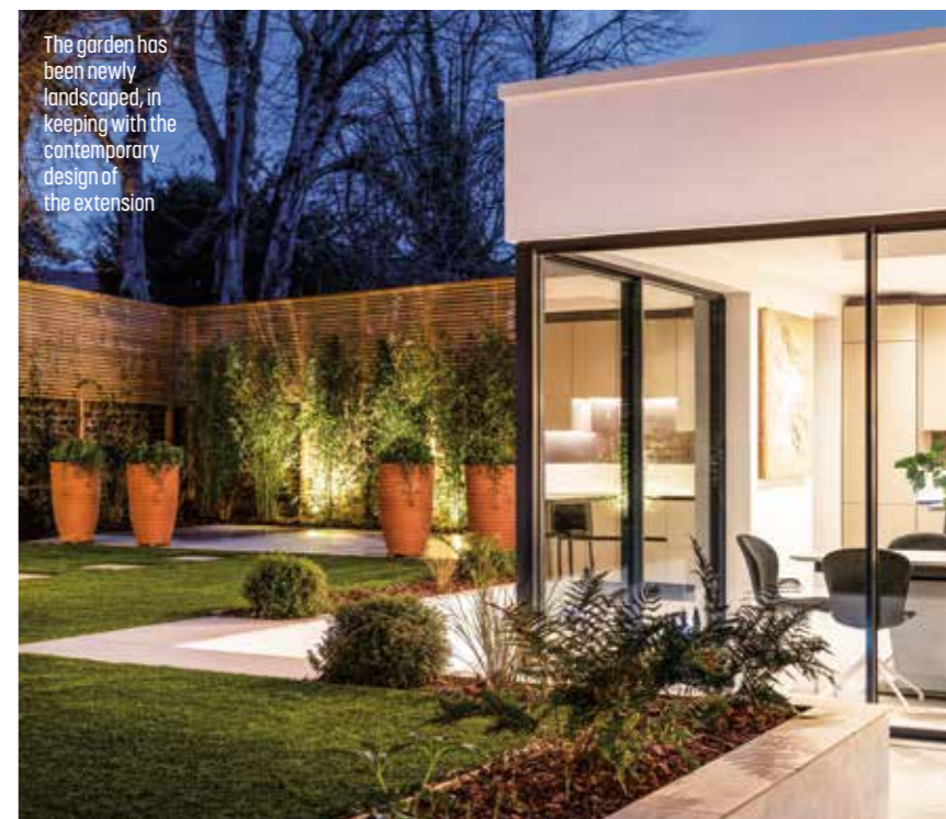
The garden has been newly landscaped, in keeping with the contemporary design of the extension

Dining table and chairs BoConcept (020 3820 2878; boconcept.com)