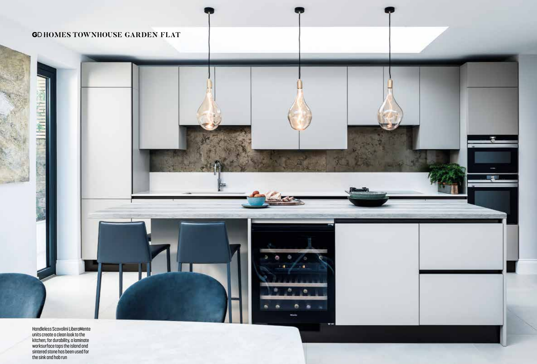
Handleless Scavolini LiberaMente units create a clean look to the kitchen; for durability, a laminate work surface tops the island and sintered stone has been used for the sink and hob run

a structural steel skeleton built into a 1.8 metre foundation, which runs horizontally through the roof and down to the ground between the side door and glazed panels. Another steel beam runs through the roof from the cantilevered corner to anchor against the back wall of the house.